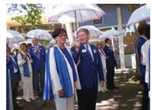
Lions of Haiti and Lions of France were some of the colourful participants in the International Parade in Seattle.