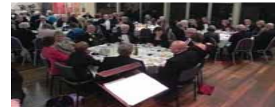
Having a good time at the DG's Handover.

The first step in solving a problem is to begin.