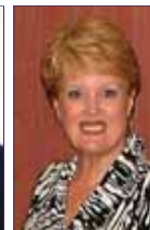
District Governor Lyn Shoemark