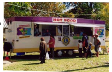
Glen Innes Lions Catering Van at the Sunday Markets

Please consider this relationship in the future. For more information your Secretary has a full breakdown on the sponsorship deal.