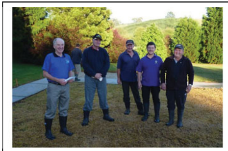
Lions of Penguin (T1) at work on the Coroneagh Park project building raised garden beds with Funding support from the Australian Lions Foundation