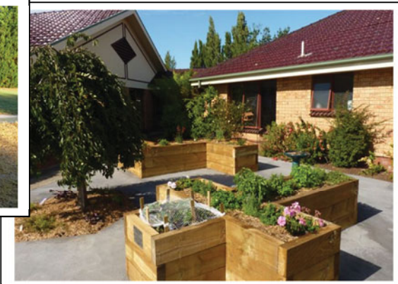
Another example of how ALF supports the Club in their community