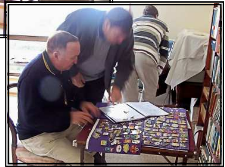
Trading in full swing, despite the postcard view