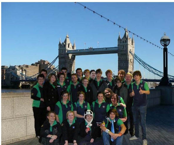
Above: 2010/11 Scandinavian/European Youth Exchange group enjoying the London Stopover before heading home to Australia

We have received some "glowing" reports on how great these youth were.